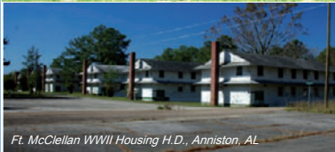
Ft. McClellan WWII Housing H.D., Anniston, AL