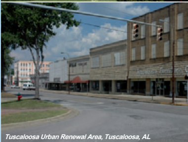
Tuscaloosa Urban Renewal Area, Tuscaloosa, AL

The City of Huntsville’s historic districts are exceptional examples of how local historic designation and design review can not only maintain the character of historic neighborhoods but substantially improve property values. SHP prepared a set of design guidelines to help the city’s historic preservation commission make more consistent decisions and to help promote a broader community understanding about the design review process.