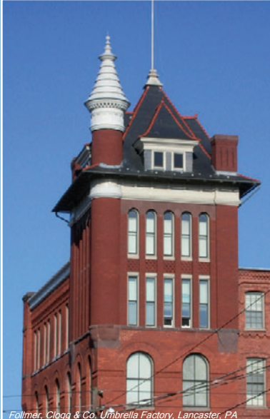
Follier, Clogg & Co. Umbrella Factory, Lancaster, PA