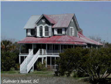
Sullivan's Island, SC