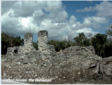
Clifton House, the Bahamas

SHP has consulted on hundreds of projects involving federal tax incentives for historic preservation including the use of rehabilitation tax credits and the donation of conservation easements. His services include design consultation, negotiations with review agencies and easement holding organizations, preparation of Historic Preservation Certification Applications, and appeals.