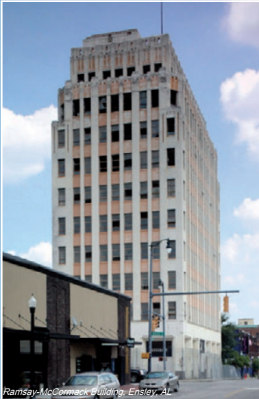
Ramsay-McCormack Building, Ensley, AL