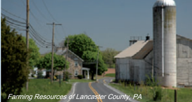
Farming Resources of Lancaster County, PA