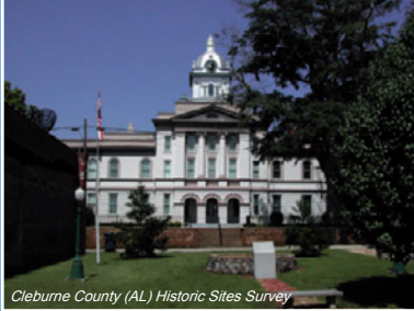
Clebune County (AL) Historic Sites Survey