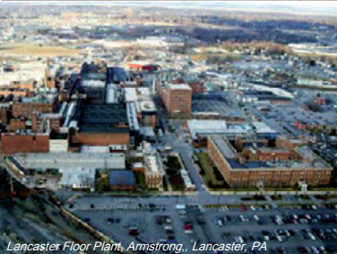
Lancaster Floor Plan, Armstrong, Lancaster, PA