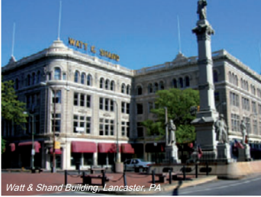
Watt & Shand Building, Lancaster, PA

*while with Preservation Consultants, Inc.