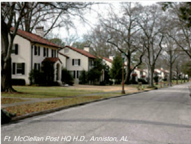
Ft. McClellan Post HQ H.D., Anniston, AL