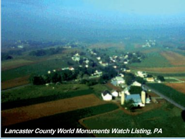
Lancaster County World Monuments Watch Listing, PA