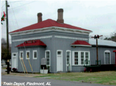
Train Depot, Piedmont, AL