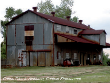
Cotton Gins in Alabama, Context Statement