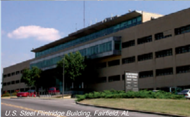
U.S. Steel Pintridge Building, Fairfield, AL