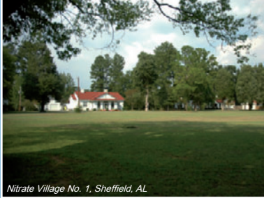
Nitate Village No. 1, Sheffield, AL