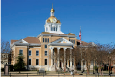
Downtown Ensley, Alabama Liles Bld., Anniston, AL