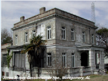
Jones-Moses-Cassenheimer Hse., Montgomery, AL