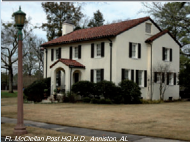
Ft. McClellan Post HQ H.D., Anniston, AL