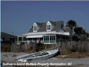
Sullivan's Island Multiple Property Nomination, SC

SHP is currently serving as the historic preservation consultant to the development team working to rehabilitate the historic Powell School. Constructed in as a grammar school, the building was converted for use as a pajama factory in 1947. SHP has prepared the nomination for the National Register of Historic Places and will assist with the approval process for federal rehabilitation tax credits.