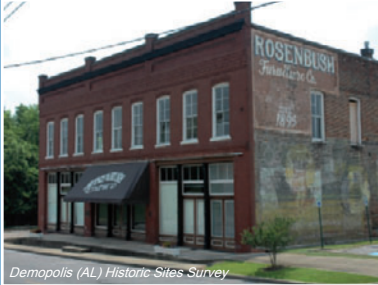
Demopolis (AL) Historic Sites Survey