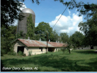
Baker Dairy, Calera, AL