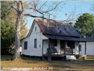
Northwest Quadrant, Beaufort, SC