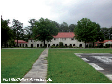
Fort McClellan, Anniston, AL

SHP completed a variety of environmental review projects involving Section 106 and other local, state, and federal regulations. In addition to negotiating with review agencies, he has completed Historic American Buildings Survey level documentation for projects involving a diverse range of sizes and complexity. In addition, SHP has completed numerous urban and rural historic resource surveys, historic structures reports, and published histories.