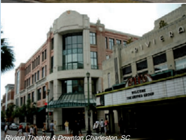
Riviera Theatre & Downtown Charleston, SC