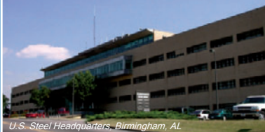
U.S. Steel Headquarters, Birmingham, AL