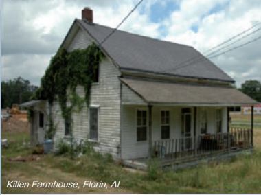
Killen Farmhouse, Florin, AL