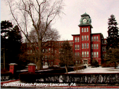
Hamilton Watch Factory, Lancaster, PA