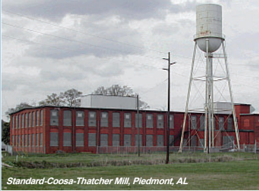
Standard-Coosa-Thatcher Mill, Piedmont, AL