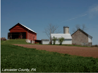
Lancaster County, PA