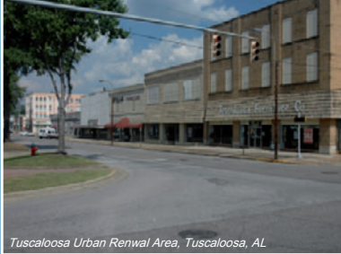
Tuscaloosa Urban Renewal Area, Tuscaloosa, AL