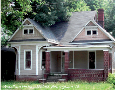
Woodlawn Historic District, Birmingham, AL