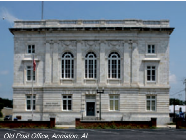
Old Post Office, Anniston, AL