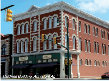
Caldwell Building, Anniston, AL

SHP has completed individual, district and multiple property nominations to the National Register of Historic Places. Mr. Schneider has extensive experience with rural historic landscape designation, including the completion of a multiple property documentation project for the Historic Farming Resources of Lancaster County, Pennsylvania. He has also completed nominations on such diverse resources as a chocolate factory and an aircraft hangar.