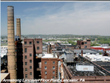
Armstrong Lancaster Floor Plant, Lancaster, PA

SHP completed Historical American Buildings Survey Documentation for three city blocks in downtown Tuscaloosa that will be demolished to make way for a new federal courthouse project. The project involved preparation of a narrative history and architectural description of the blocks and their individual buildings, large format and digital photography, and measured streetscape drawings.