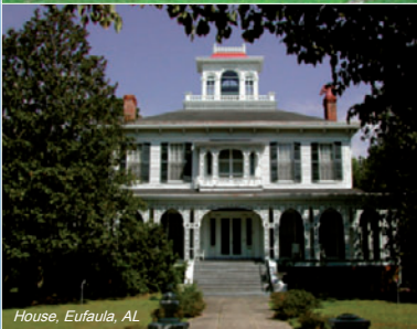
House, Eufaula, AL