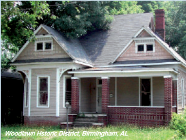
Woodlawn Historic District, Birmingham, AL