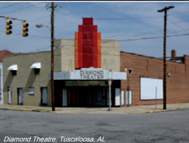
Diamond Theatre, Tuscaloosa, AL