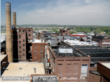
Armstrong Lancaster Floor Plant, Lancaster, PA