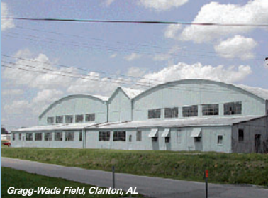
Gragg-Wade Field, Clanton, AL