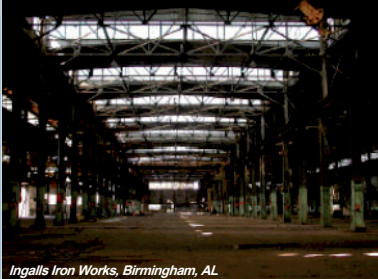
Ingalls Iron Works, Birmingham, AL