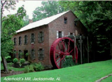
Aderholdt's Mill, Jacksonville, AL