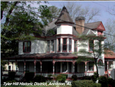
Tyler Hill Historic District, Anniston, AL

Traditionally the resort island for the residents of Charleston, rising property values have resulted in the demolition of many of the islands historic resources. SHP has completed historic preservation component of a major revision to the town’s planning and zoning ordinances (2003), a National Register Multiple Property Documentation Form and four historic district nominations (2006), and a selected survey of buildings over sixty years old for possible local designation (2007).