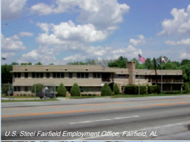
U.S. Steel Fairfield Employment Office, Fairfield, AL