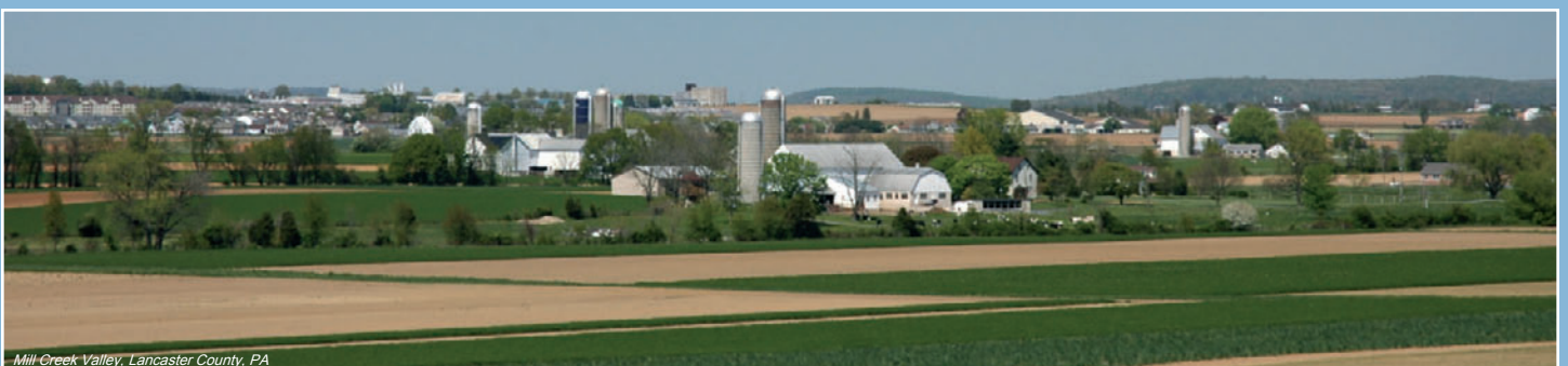
Mill Creek Valley, Lancaster County, PA