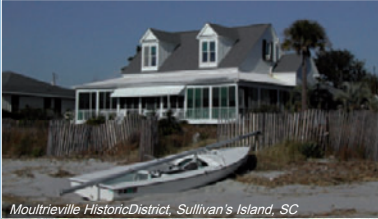
Moultrieville Historic District, Sullivan's Island, SC