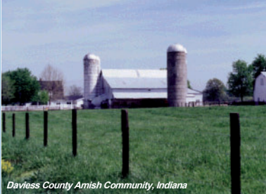
Davies County Amish Community, Indiana