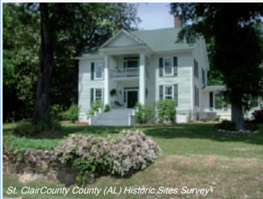
St. Clair County (AL) Historic Sites Survey