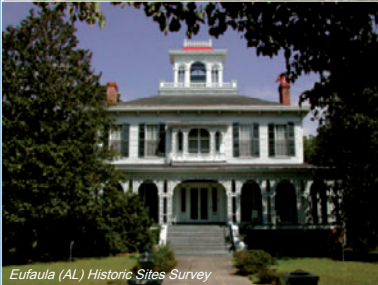
Eufaula (AL) Historic Sites Survey